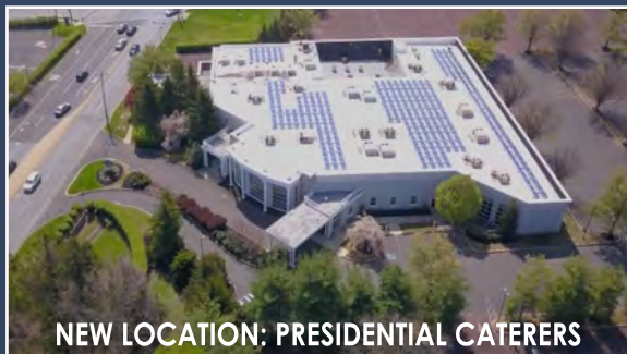
NEW LOCATION: PRESIDENTIAL CATERERS

Presidential Caterers is located at the intersection of Route 202 and Germantown Pike in Norristown, PA; minutes from the PA Turnpike and Rte. 476 in the heart of Montgomery County, and legal hubs like Blue Bell, downtown Norristown, Philadelphia, and surrounding counties.