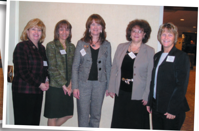
Independence – Central PA Officers with ALA National President.