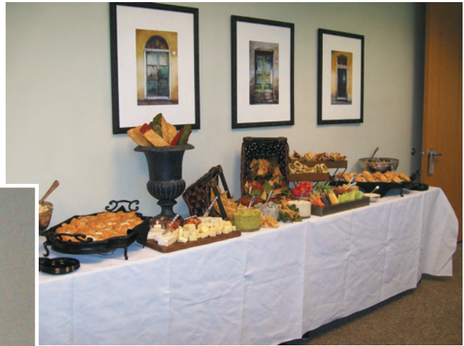
Cheese and Hors D'Oeuvres Buffet