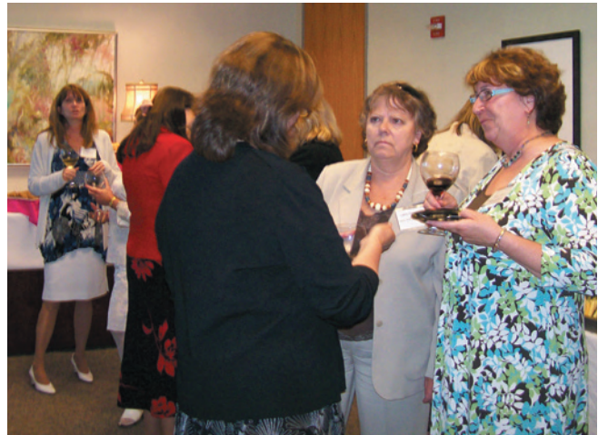
Attendees at Reception