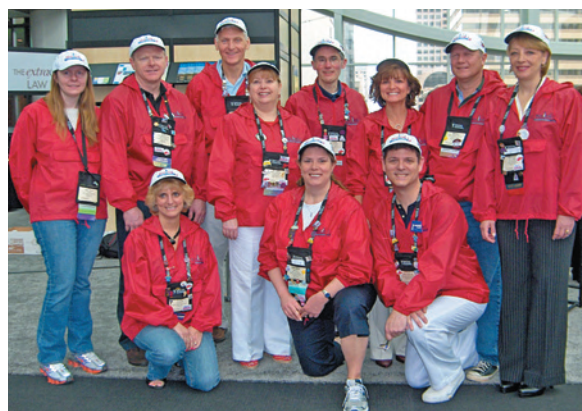
Region 1 Team