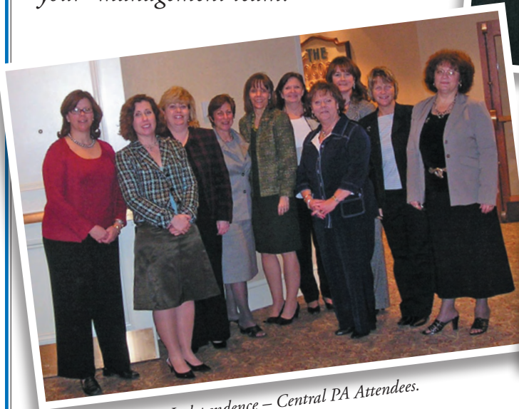
Independence – Central PA Attendees.