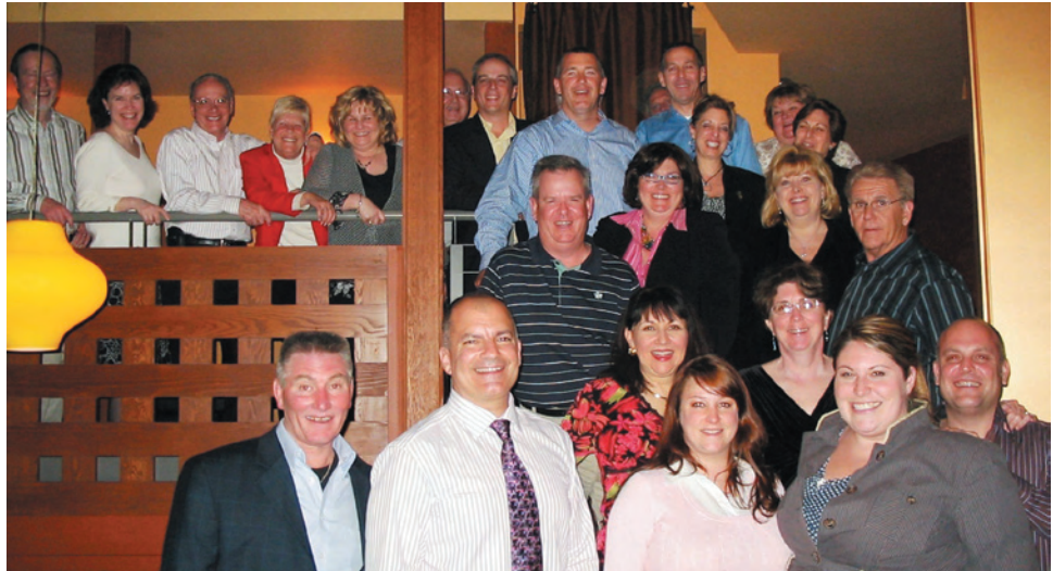
The mindSHIFT Group

Another highlight of attending the conference is to reunite with old friends and meet new acquaintances from our peers throughout the corners of the earth who are members of ALA.