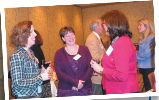
Some of the attendees at dinner.